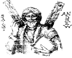
The First Called