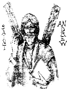
The First Called