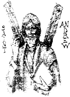
The First Called