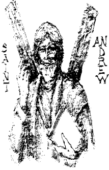
The First Called