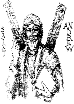
The First Called