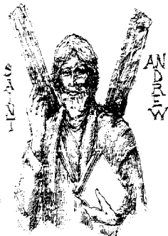
The First Called